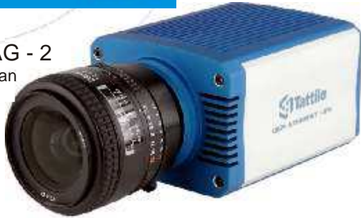
Model TAG - 2 Line Scan