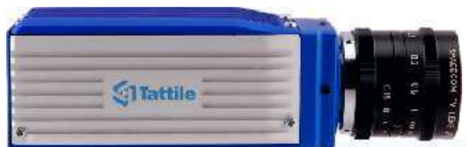
Model TAG - 3, Side View