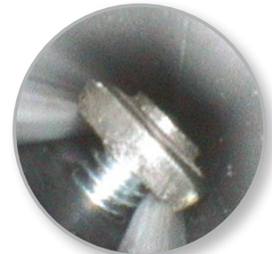
Position of a screw