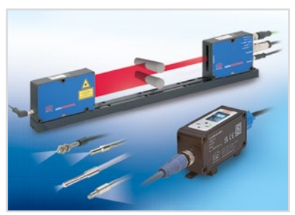
Optical micrometers and fiber optics, measuring and test amplifiers