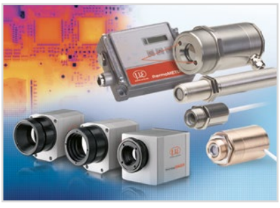
Sensors and measurement devices for non-contact temperature measurement