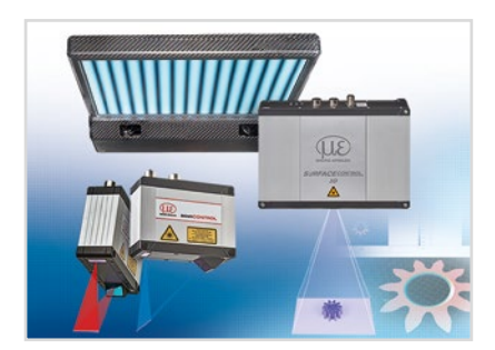
3D measurement technology for dimensional testing and surface inspection