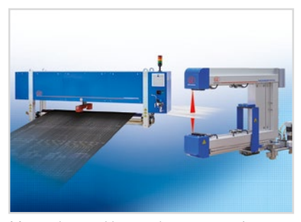
Measuring and inspection systems for metal strips, plastics and rubber