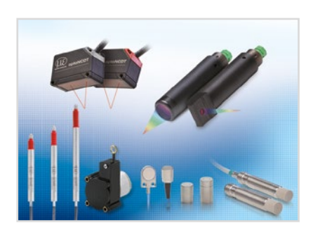
Sensors and systems for displacement, distance and position